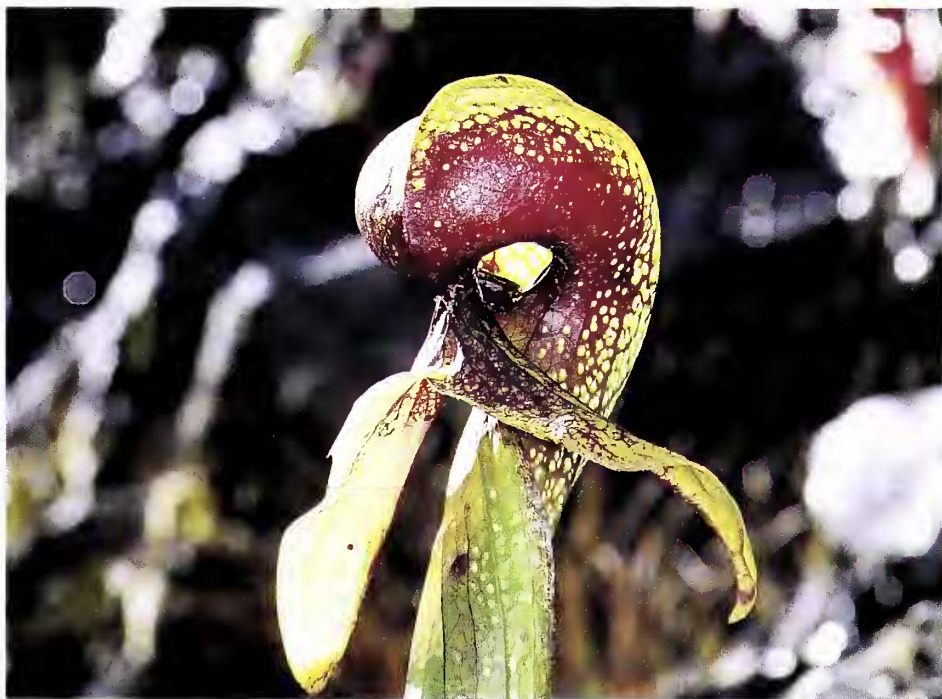
Figure 5: Darlingtonia : red keel variant.